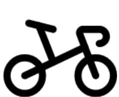
Sponsored University Bicycle