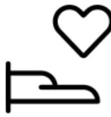
Support for family caregivers