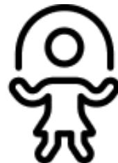
Moving lunch break