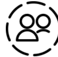
Free counseling centers