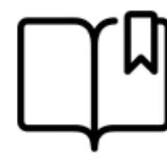
Initial and continuing education