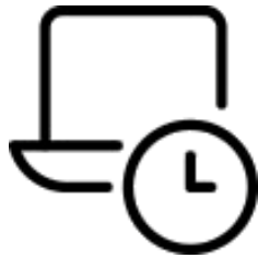
Flexible working time models