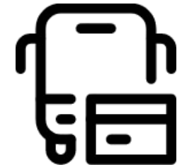
Good public connections and ticket subsidy