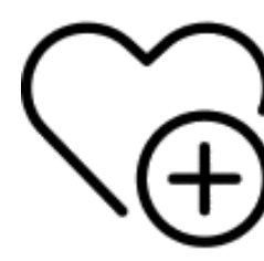
Occupational health services