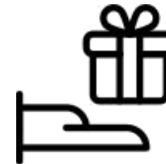
Employee discounts for leisure, sports and culture