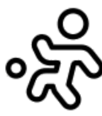
USI sports courses and sports fields